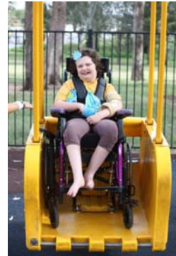
Dakota on Liberty