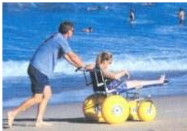
Noosa Beach Hire Buggy

If you are interested in accessing a Beach Buggy in the area's listed above please contact your Beachcomber Coordinator who can give you more detailed information.